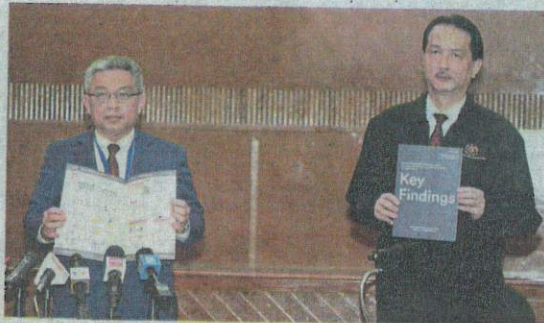
Worrying trend: Dr Adham Baba and Health DG Datuk Dr Nor Hisham Abdullah (right) launching the NHMS 2019 book at Putrajaya.

On the NHMS 2015, the prevalence of diabetes in the country was reported as 17.5%, before the measurement of the disease was changed in line with World Health Organisation standards.)