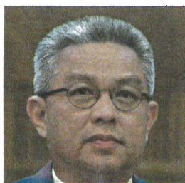
Dr Adham Baba

Dr Adham berkata, berdasarkan NHMS 2019, seorang dari-