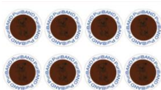
Figure 1: Puri Band

One of the non-contact device is the Puri Band. Puri Band is the Self-Check Temperature Patch that measures body temperature by colour change of a small patch sticker. When attached, the colour of the band changes with body temperature. For normal body temperature, it turns green. If it turns yellow, it means that the person has high fever of more than 37.5 degree. User can simply attach the patch directly to places where body temperature can be easily measured, such as wrists and neck areas. When a sticker is applied to the skin, the color changes instantly in real time according to body temperature.