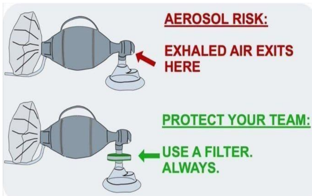
Bag mask with an attached HEPA